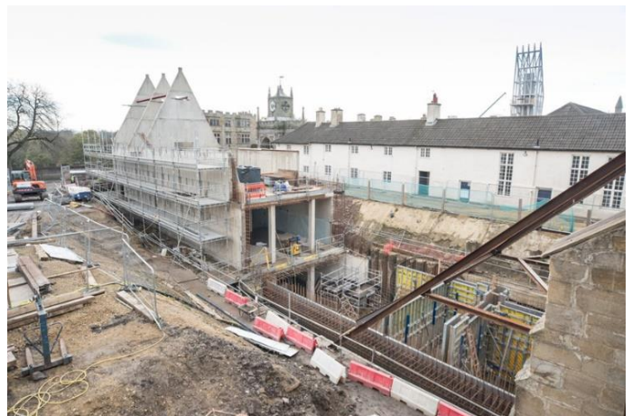
Above: Faith Museum under construction