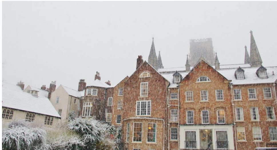
A view from St Chad's College gardens in winter