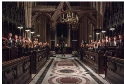
The choir in Durham Cathedral just before the annual Advent Procession