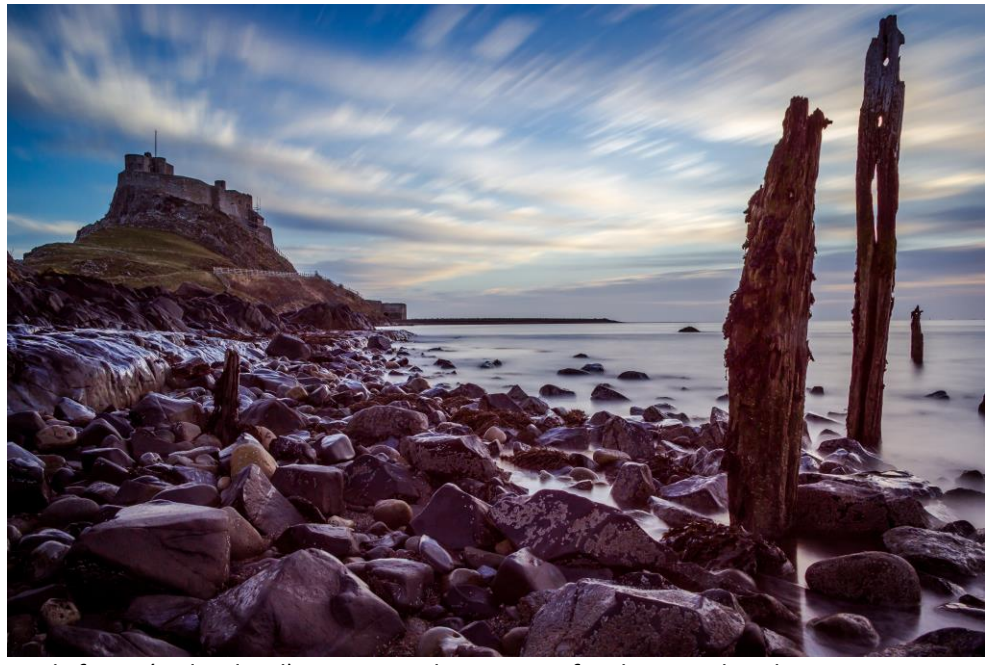
Lindisfarne (Holy Island) – see Monday 24 June for day-trip details